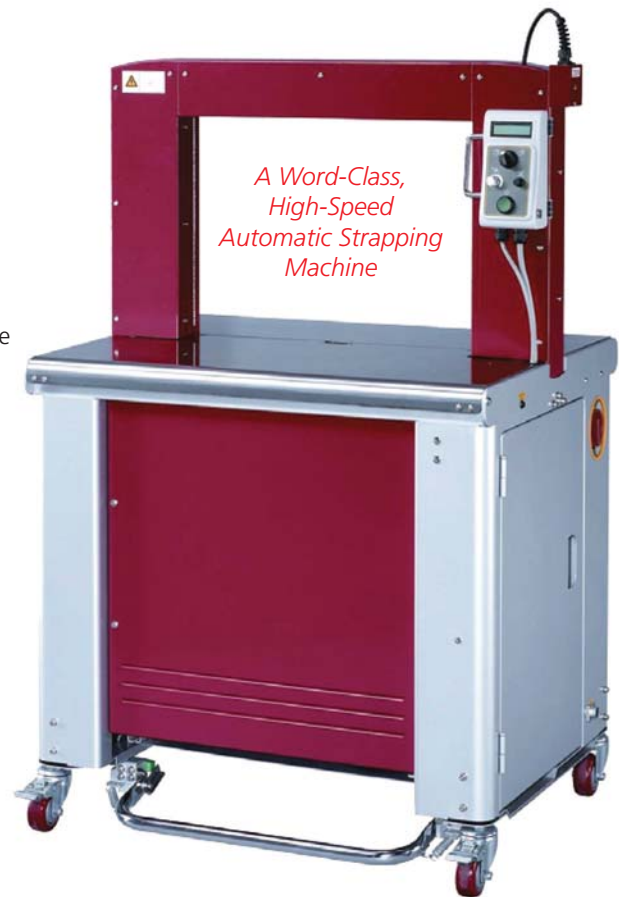
A World-Class, High-Speed Automatic Strapping Machine