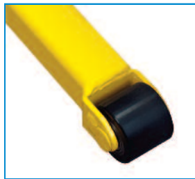
Outrigger Load Wheels