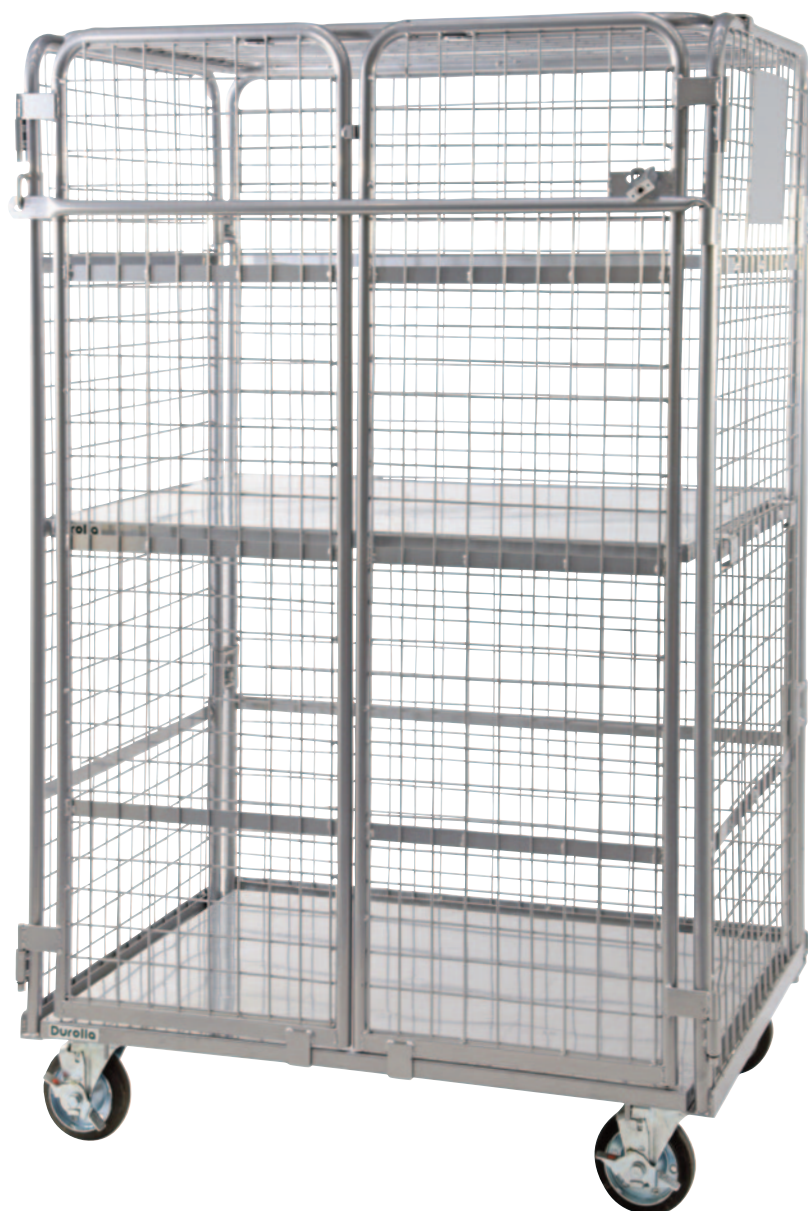
T5315M Mesh version with 2 shelves