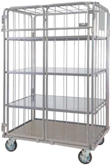
T5315B – Bar version with 3 shelves