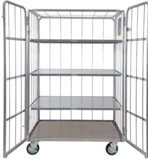
Doors able to be folded back for complete access to product inside