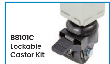
B810C Lockable Castor Kit