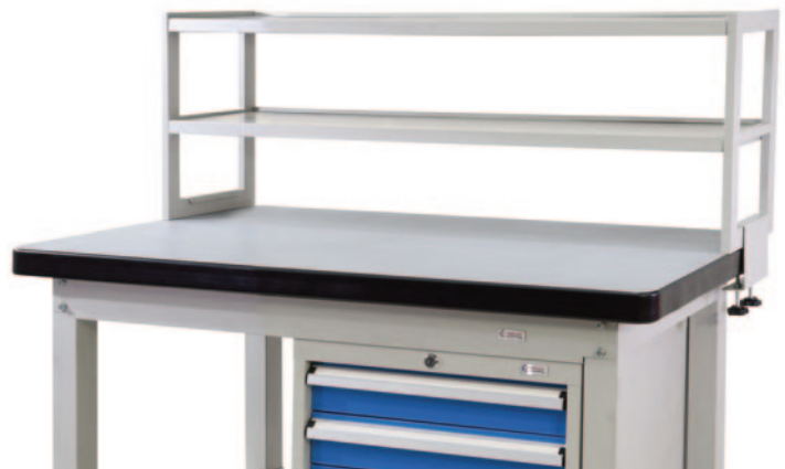
M7253 - 2 Tier Shelf