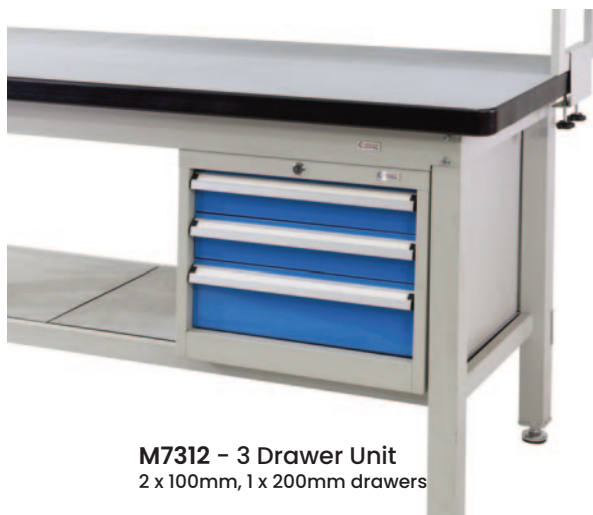
M7312 - 3 Drawer Unit 2 x 100mm, 1 x 200mm drawers