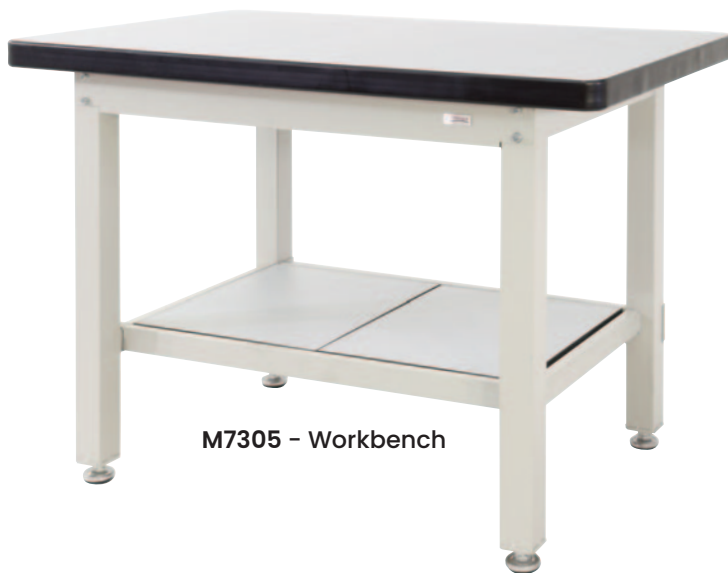
M7305 - Workbench