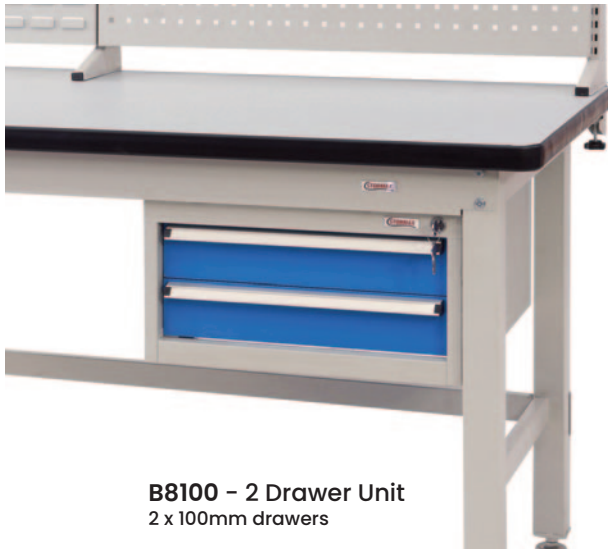
B8100 – 2 Drawer Unit 2 x 100mm drawers