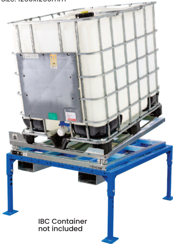
IBC Container not included