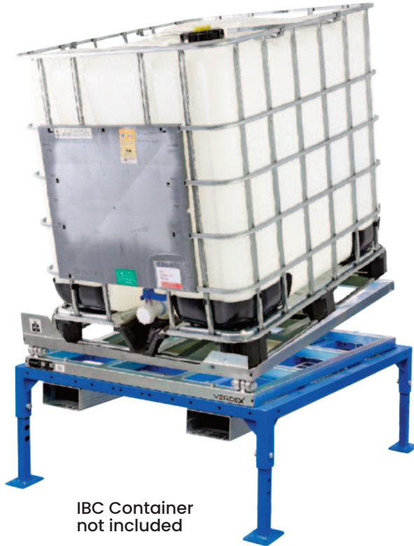
IBC Container not included