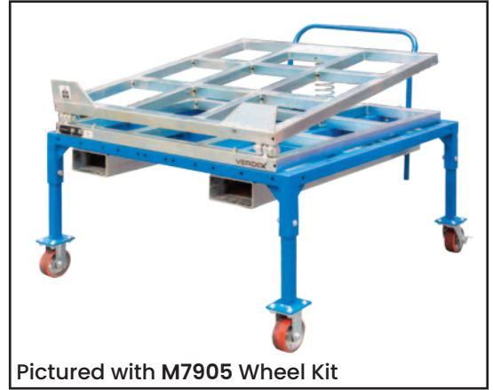
Pictured with M7905 Wheel Kit