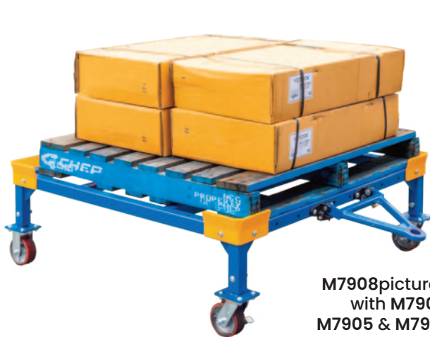
M7908 pictured with M7903, M7905 & M7907