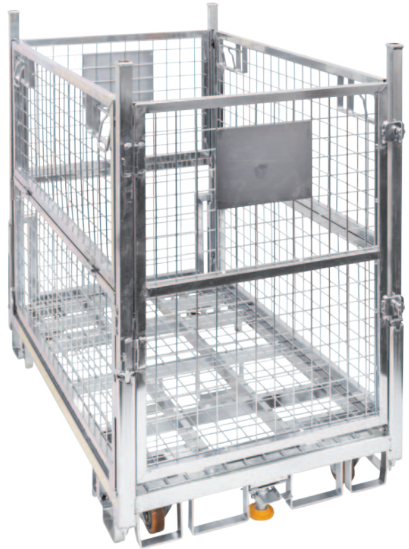
Pictured with M7562