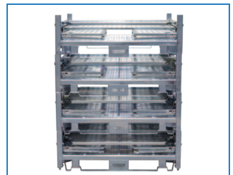
M7541 Collapsed & Stacked