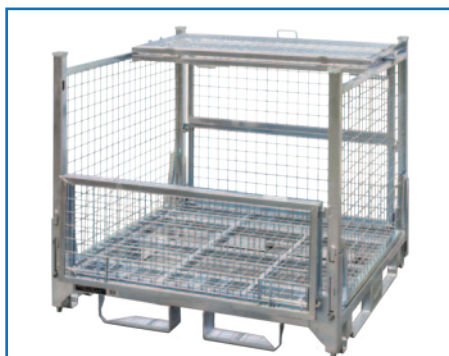
M7541 pictured with M7533