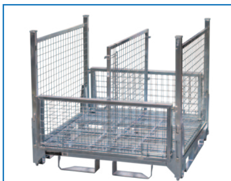
M7541 pictured with M7534