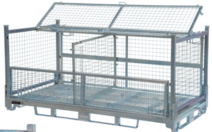
M7540 pictured with M7543 & M7534