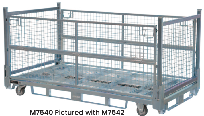
M7540 Pictured with M7542