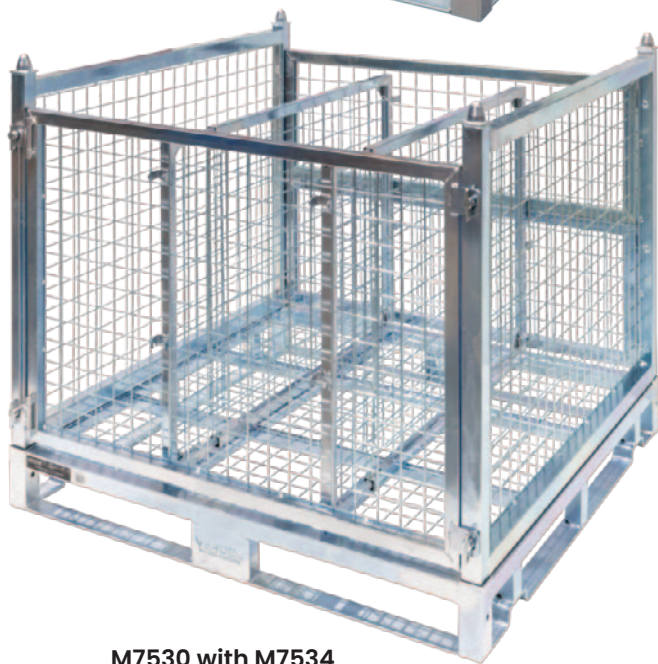
M7530 with M7534