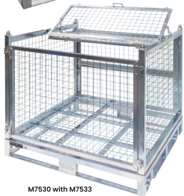
M7530 with M7533