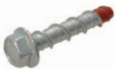
M7483 Screw Bolt to suit