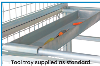
Tool tray supplied as standard

NO MORE THAN 2 PERSONS MAY BE LIFTED. WEIGHT OF PLATFORM 134KGS. THE LOAD INCLUDING PERSONNEL & EQUIPMENT SHALL NOT EXCEED 250KG USE ONLY ON INDUSTRIAL TRUCKS HAVING A CAPACITY OF 1800KG (COUNTERBALANCED) OR 1080KG (REACH TRUCK) AS APPROVED. DO NOT USE IN PROXIMITY TO LIVE ELECTRICAL EQUIPMENT. FOR USE ONLY AS APPROVED BY STATE STATUTORY AUTHORITY.