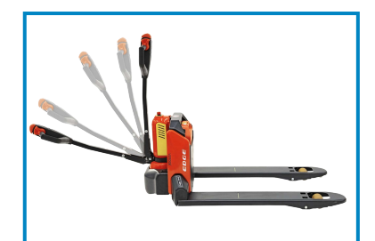
Handle is supported by an air spring so that the handle returns smoothly to the vertical position