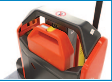
Removable Lithium Battery