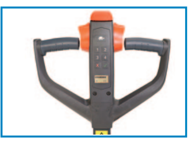
Pin can be set so only selected personnel can use the unit