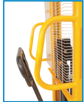
Handles for easy manoeuvrability