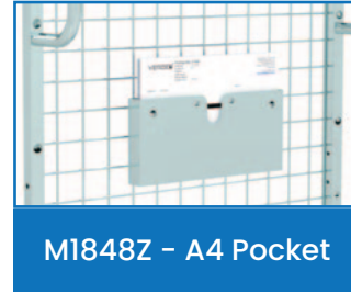
M1848Z – A4 Pocket