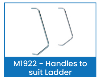
M1922 – Handles to suit Ladder