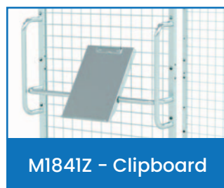
M1841Z – Clipboard