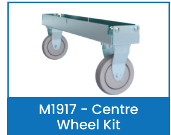
M1917 – Centre Wheel Kit