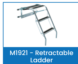
M1921 – Retractable Ladder