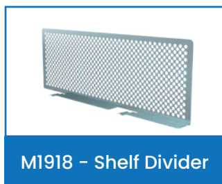
M1918 – Shelf Divider