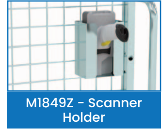
M1849Z – Scanner Holder