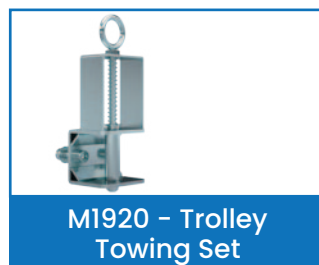
M1920 – Trolley Towing Set