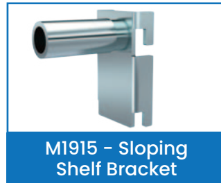
M1915 – Sloping Shelf Bracket