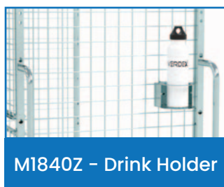
M1840Z – Drink Holder