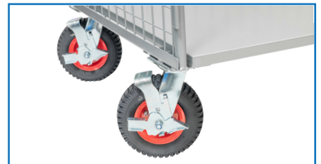
M1055 – Flat Free Wheel Kit