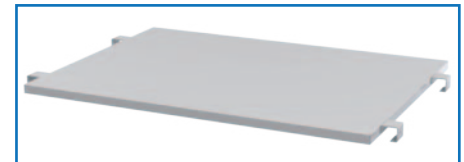
M1901 – Optional Shelves