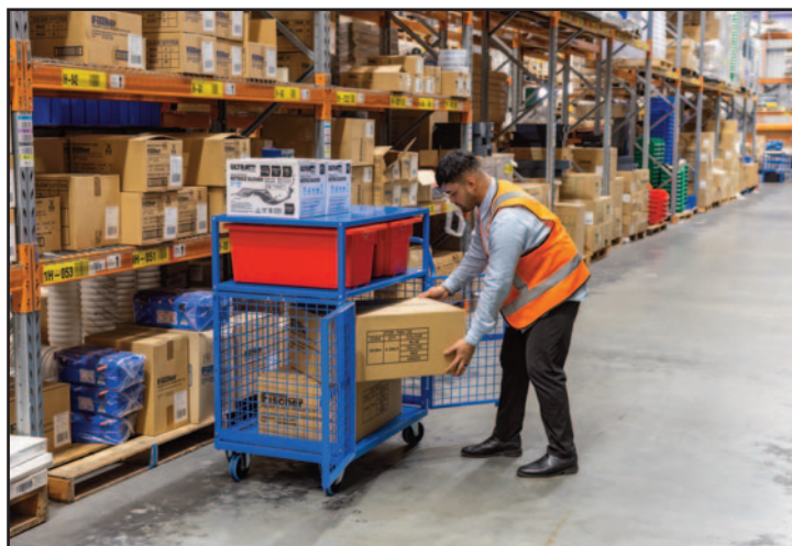
Accessory Shelf Unit