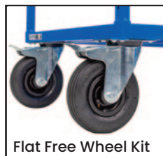
Flat Free Wheel Kit