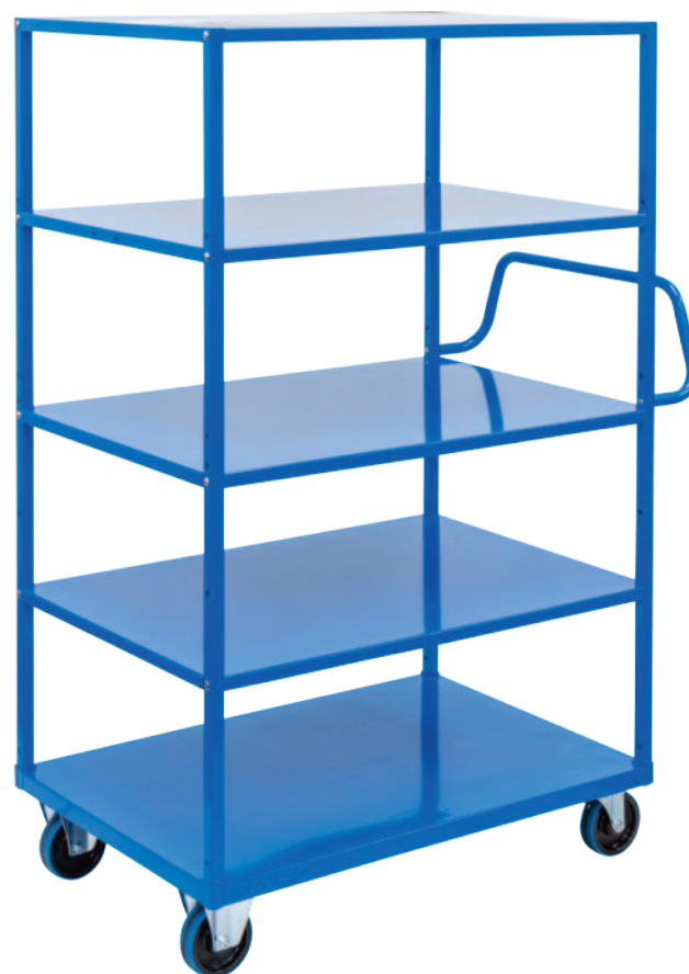
Accessory Shelf Unit