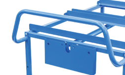
M1848 A4 Pocket