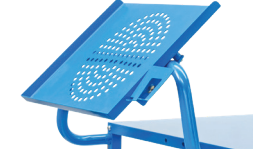
M1842 Laptop Holder