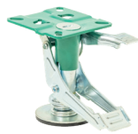
M1846 Floor Lock Brake