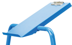
M1841 Clipboard Holder