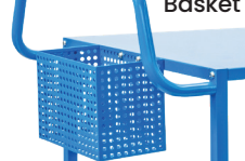
M1843 Mesh Basket