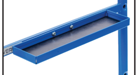
M1844 Accessory Shelf