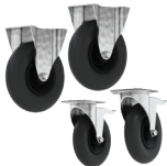
M1845 Flat Free Wheel Kit