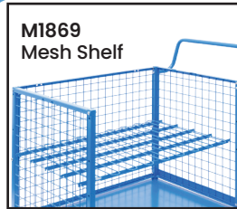
M1869 Mesh Shelf