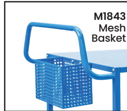
M1843 Mesh Basket