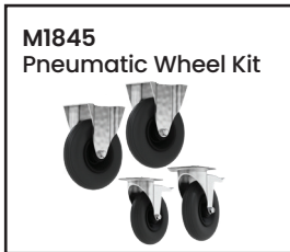
M1845 Pneumatic Wheel Kit