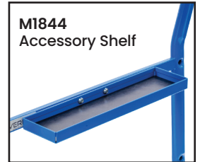
M1844 Accessory Shelf