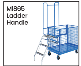
M1865 Ladder Handle