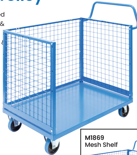
M1869 Mesh Shelf