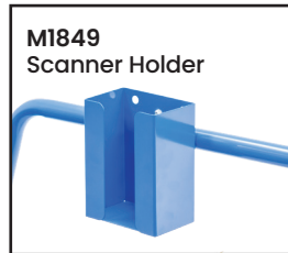
M1849 Scanner Holder