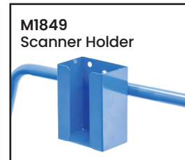
M1849 Scanner Holder