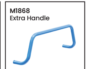
M1868 Extra Handle