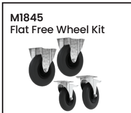
M1845 Flat Free Wheel Kit