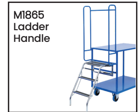
M1865 Ladder Handle