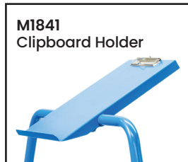
M1841 Clipboard Holder