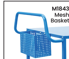
M1843 Mesh Basket