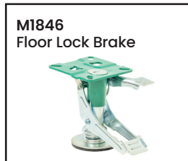
M1846 Floor Lock Brake