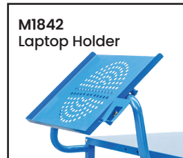
M1842 Laptop Holder