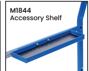
M1844 Accessory Shelf