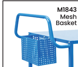
M1843 Mesh Basket