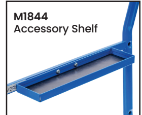
M1844 Accessory Shelf