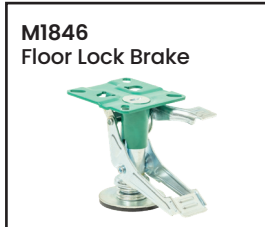
M1846 Floor Lock Brake