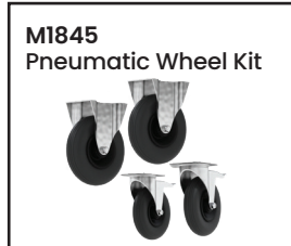
M1845 Pneumatic Wheel Kit