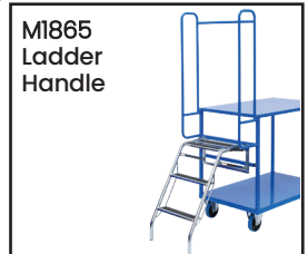
M1865 Ladder Handle