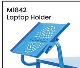
M1842 Laptop Holder