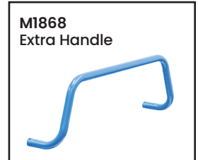
M1868 Extra Handle