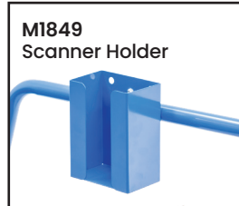
M1849 Scanner Holder