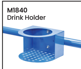
M1840 Drink Holder