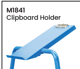
M1841 Clipboard Holder