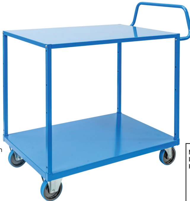
M1865 Ladder Handle