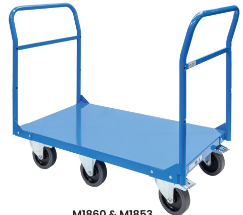
M1860 &amp; M1853