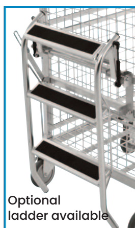
Optional ladder available