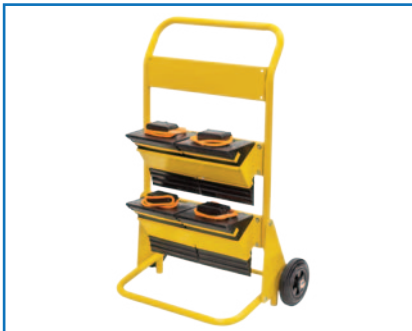
M1213 Wheel Chock Trolley