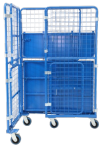
Trolley can be folded for nesting when not in use