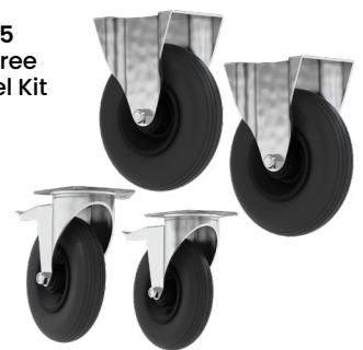
M1845 Flat Free Wheel Kit