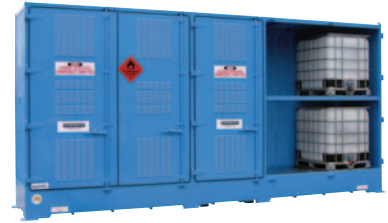
DG8057I: 10 IBC Store