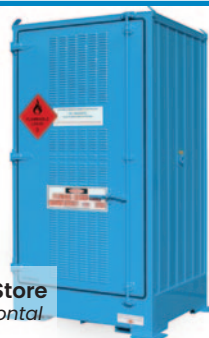
DG8052I: 2 IBC Store Vertical and Horizontal version available