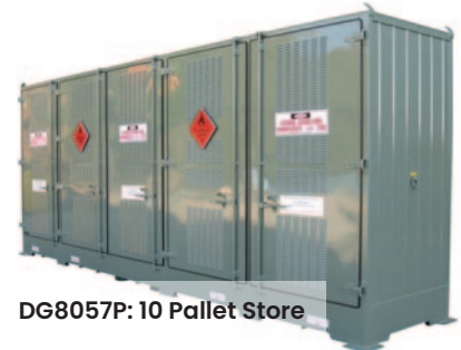
DG8057P: 10 Pallet Store