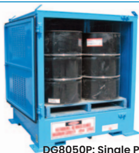
DG8050P: Single Pallet Store