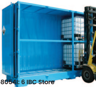
DG8054I: 6 IBC Store