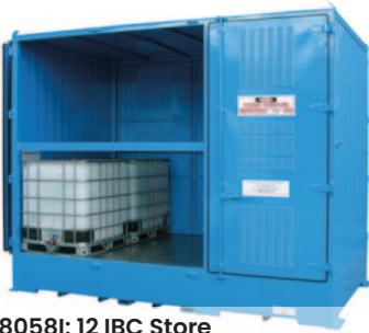
DG8058I: 12 IBC Store Single and Double depth store available (Double depth pictured)