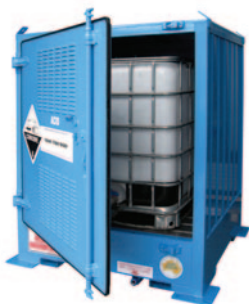
DG8050I: Single IBC Store