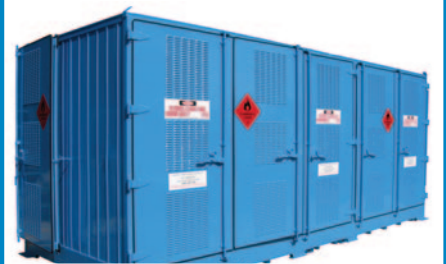
DG8062P: 20 Pallet Store Single and Double depth store available (Double depth pictured)