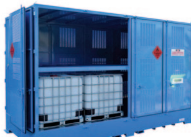
DG8060I: 16 IBC Store Single and Double depth store available (Double depth pictured)