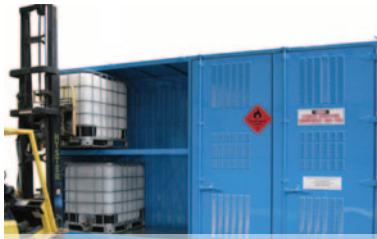
DG8055I: 8 IBC Store Single and Double depth store available (Single depth pictured)