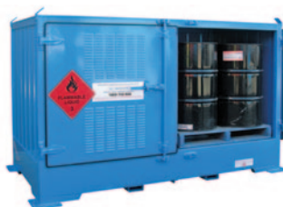
DG8052P: 2 Pallet Store Vertical and Horizontal version available