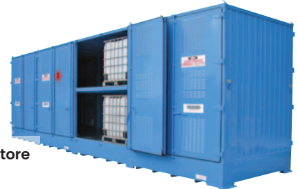
DG8064I: 32 IBC Store