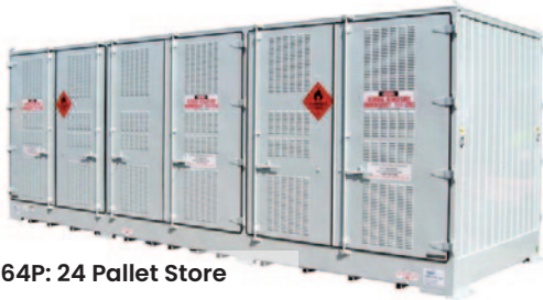
DG8064P: 24 Pallet Store