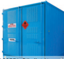
DG8055P: 8 Pallet Store Single and Double depth store available (Double depth pictured)