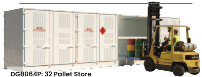
DG8064P: 32 Pallet Store

Visit www.mhaproducts.com.au for more images and details