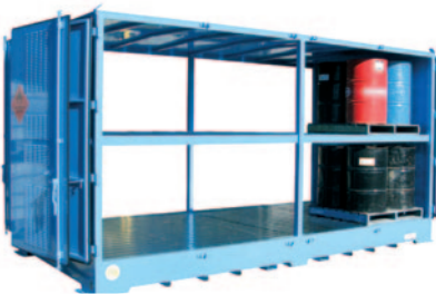
DG8060P: 16 Pallet Store Single and Double depth store available (Double depth pictured)