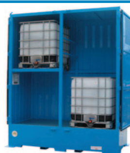
DG8053I: 4 IBC Store