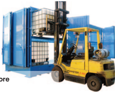
DG8064I: 24 IBC Store