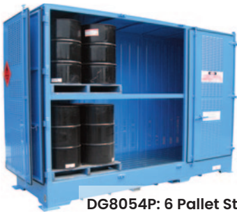
DG8054P: 6 Pallet Store