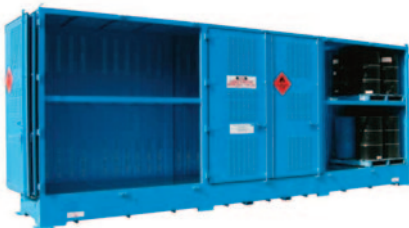
DG8058P: 12 Pallet Store Single and Double depth store available (Single depth pictured)