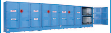
DG8062I: 20 IBC Store Single and Double depth store available (Single depth pictured)