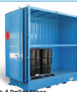
DG8053P: 4 Pallet Store