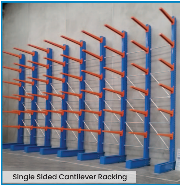
Single Sided Cantilever Racking

Available in both single and double sided configurations in both medium duty and heavy duty versions. Our cantilever racking is also available in galvanised finish which is great for outdoor storage areas.