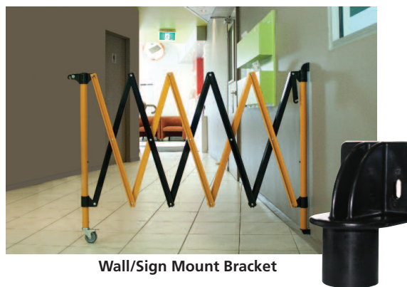
Wall/Sign Mount Bracket