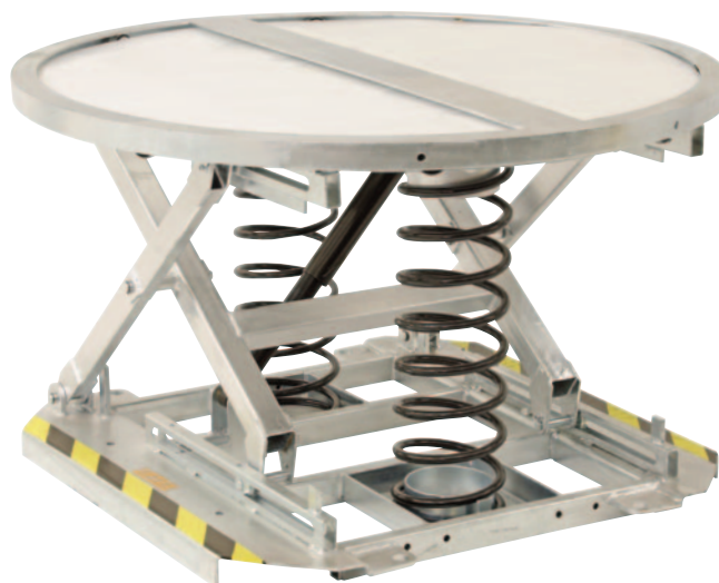
31032A (galvanised model)