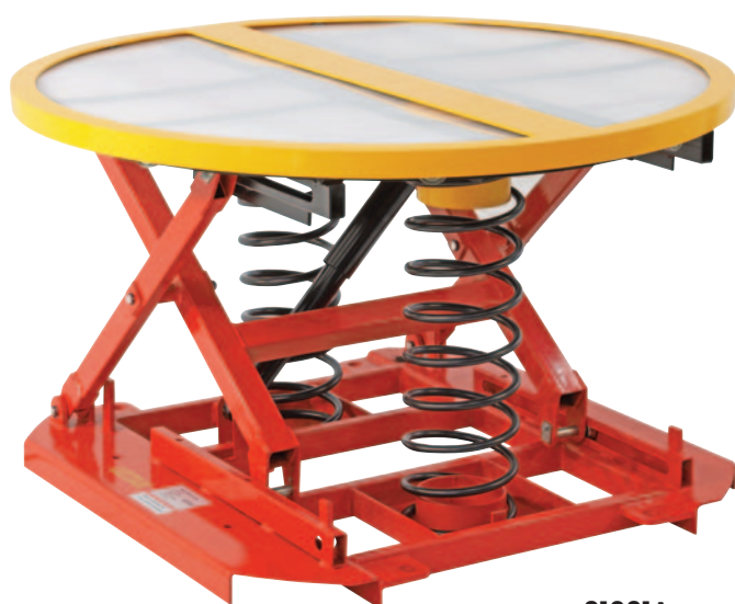
31031A (powder coated model)