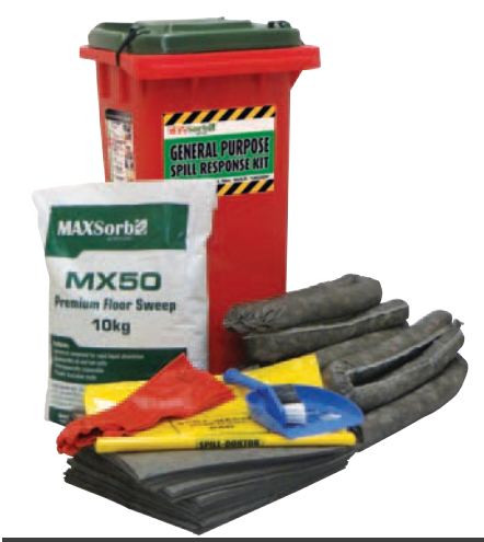
Please Note: Image shown is the universal kit

Content: 1 x 1.2m absorbent miniboom, 20 x 410mm x 460mm absorbent pads, 1 x 5kg MaxSorb premium floorsweep, 1 x elbow length PVC gloves, 1 x printed disposal bag, 1 x PVC labelled carry bag, 1 x product instruction sheet including re-order form