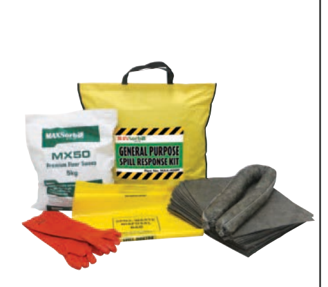
Please Note: Image shown is the universal kit

OIL & FUEL Clean-up of oils, fuels and other non-water soluble liquids. Not suitable for water based liquids