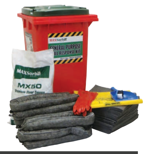
Please Note: Image shown is the universal kit

Content: 3 \times 3.0 m absorbent minibooms, 50 \times 410 mm \times 460 mm absorbent pads, 1 \times 10 kg MaxSorb premium floorsweep, 1 \times 10 kg max set, 1 \times 10 kg length PVC gloves, 4 \times 10 kg printed disposal bags, 1 \times 120 kg labelled wheelie bin, 1 \times 10 kg product instruction sheet including re-order form