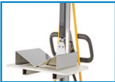
V Block Attachment