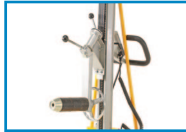
Reel Handler Rotator Attachment