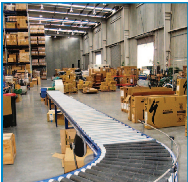
Gravity roller conveyor in bike warehouse