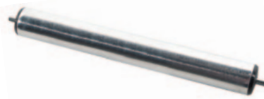
50mm Rollers to suit straight frames – Steel Rollers