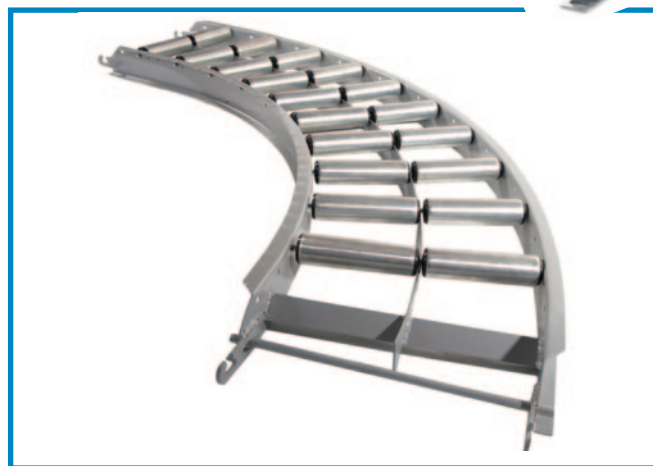
Curved Conveyor Frame – Mild Steel Powdercoated (90 degree bend)