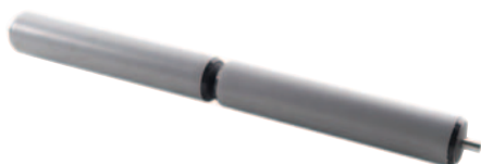
50mm Rollers to suit curved frames – Poly Rollers