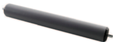
50mm Rollers to suit straight frames – Poly Rollers